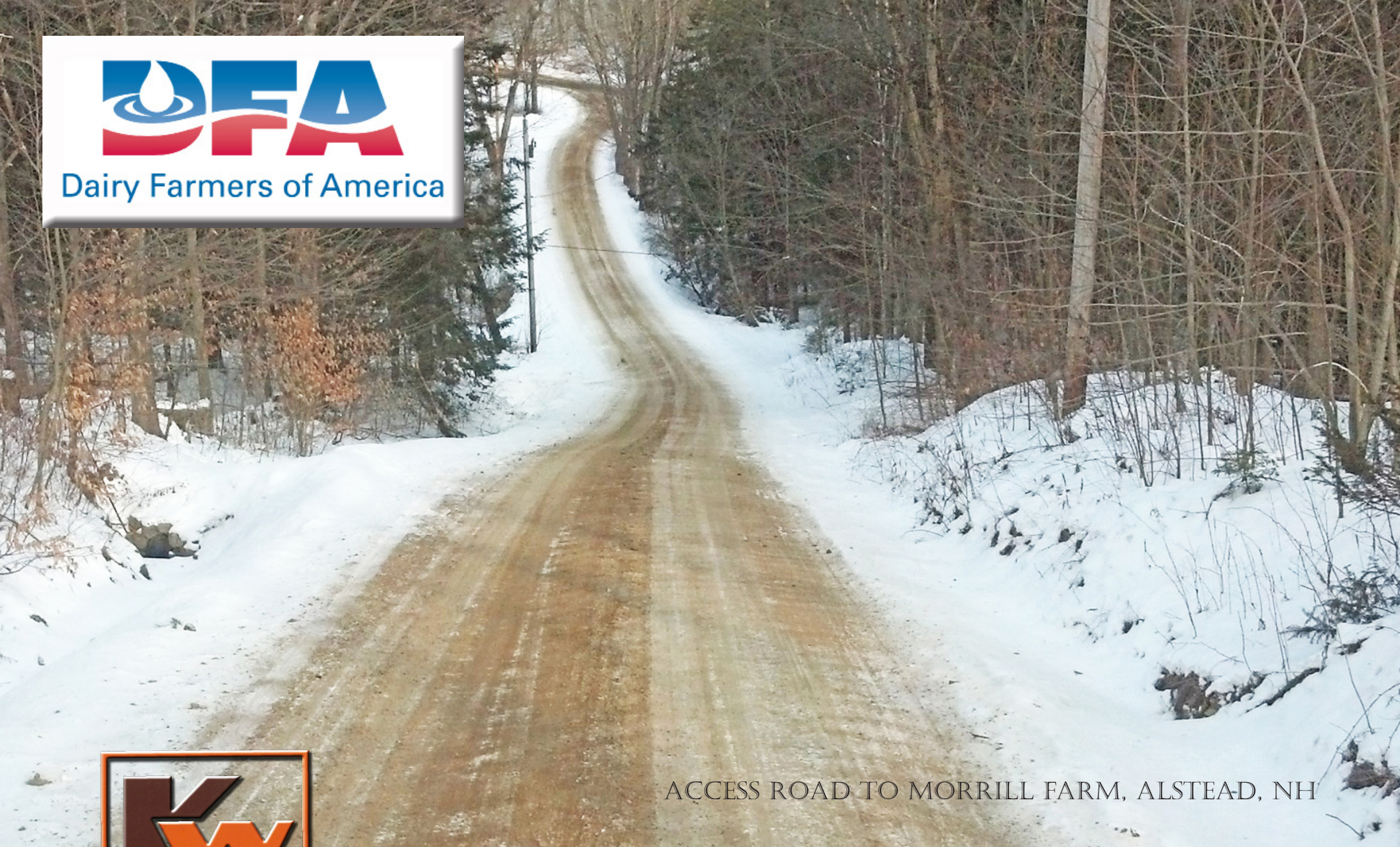
ACCESS ROAD TO MORRILL FARM, ALSTEAD, NH